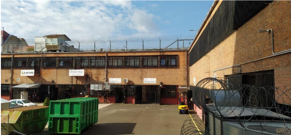
Employment department in the Object

On 15 September 2023, the Commissioner for Fundamental Rights of Hungary, responsible for performing the tasks of the National Preventive Mechanism, and his staff members visited the Balassagyarmat Prison and Detention Centre (hereinafter: the "Facility").