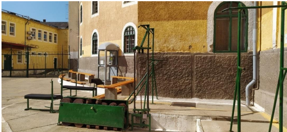
Sports and walking yard of the Balassagyarmat Prison