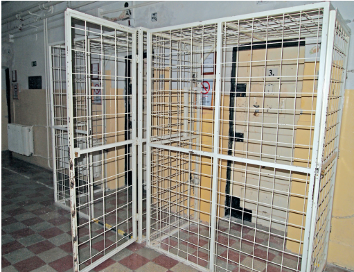
“Open regime” in the Somogy County Remand Prison

The visiting delegation found two cells where the open regime was ensured for the detainees so that the doors did not open directly to the corridor, but to an area of about 0.75–1.0 square meter surrounded by bars.