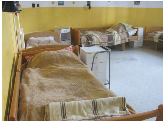
Bedroom in the Pécel Center

There were 48 persons, including 19 men and 29 women, residing at the Assisted Living Center for the Elderly in Pécel (hereinafter the "Pécel Center") at the time of the visit. Among them, 23 persons were under guardianship. By age group: 19 persons under the age of 69, and 29 were above 70. In the one two-bed, two four-bed, one five-bed, and two six-bed rooms in Building "A," there were altogether 27 demented persons requiring close monitoring; in the three three-bed and three four-bed rooms of Building "B," there were altogether 21 ambulant persons not requiring constant monitoring. The placement of the residents is primarily determined by whether they arrive at the institution as ambulant or bed-patients. The newly arrived are asked with