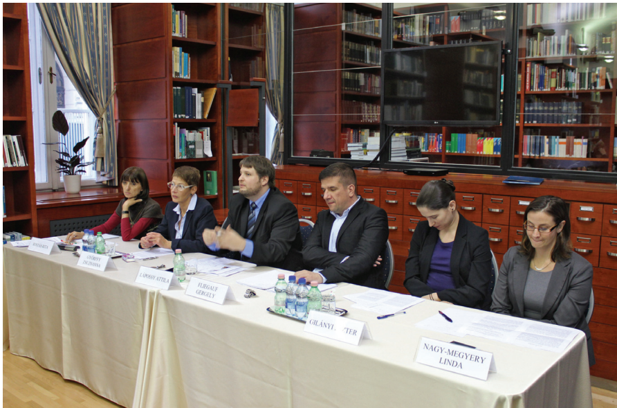
Interactive roundtable discussion during the conference entitled “Up close and personal with the rights of the child – The dimensions of vulnerability and the way out”

On November 17, 2016, in my Office, with the cooperation of the Terre des Hommes Hungary Foundation and the Barnahus Project of Szombathely, I organized a children’s rights conference under the title “Up close and personal with the rights of the child – The dimensions of vulnerability and the way out.” Within the frameworks of this event, with the cooperation of the Unit for Children’s Rights proceeding within my general competences and the