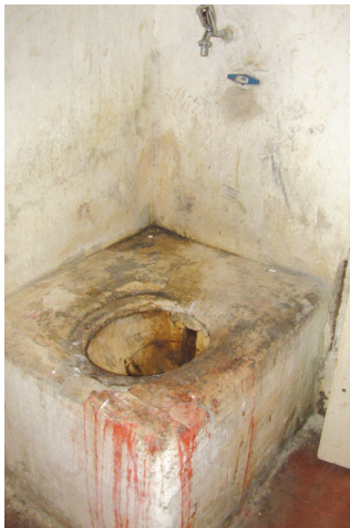
At the time of the 2015 visit