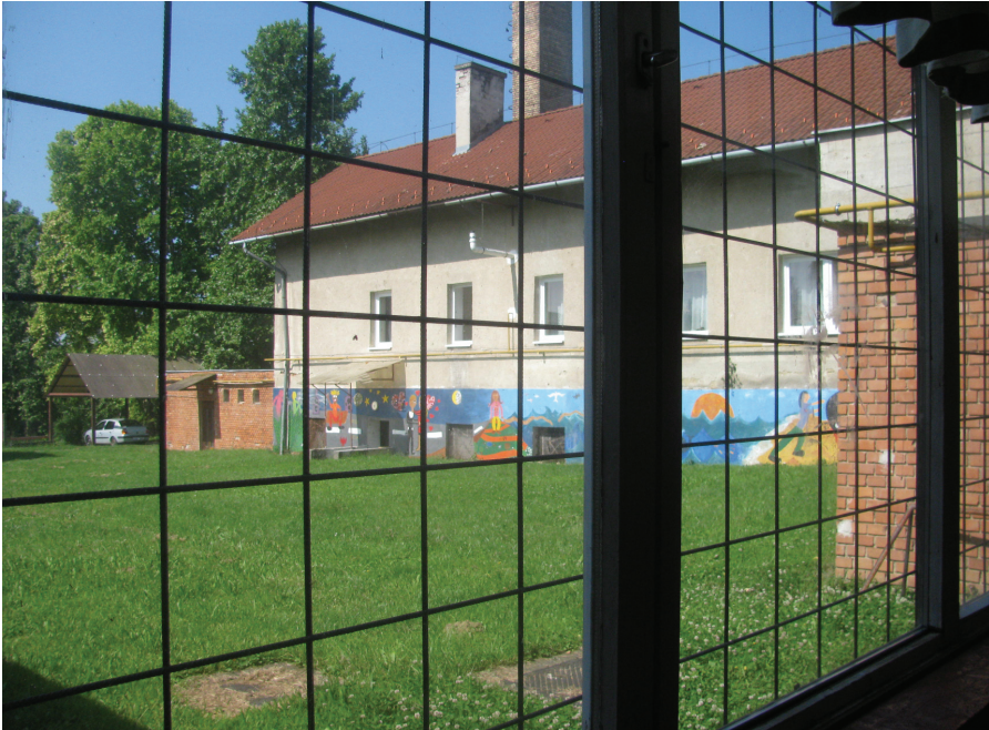
The courtyard of the Zita Children's Home

In the Zita Home for Children with Special Needs operated by the Somogy County Child Protection Directorate (hereinafter the Zita Children's Home), of the authorized capacity of 32, there were 30 children with special needs in three groups of boys and one group of girls at the time of the visit.