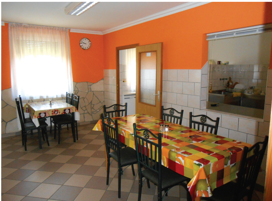
Mess room in the Segítő Kéz Assisted Living Center

The residents in Building 1 lived in one double and five single rooms. The management's office, the staff restroom, the nurses' room, a storage room, and