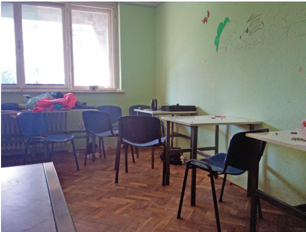
Duty room, Cseppekő Children's Home

caused an impropriety in connection with the children's rights to education, to care, and to the protection necessary for their proper development.