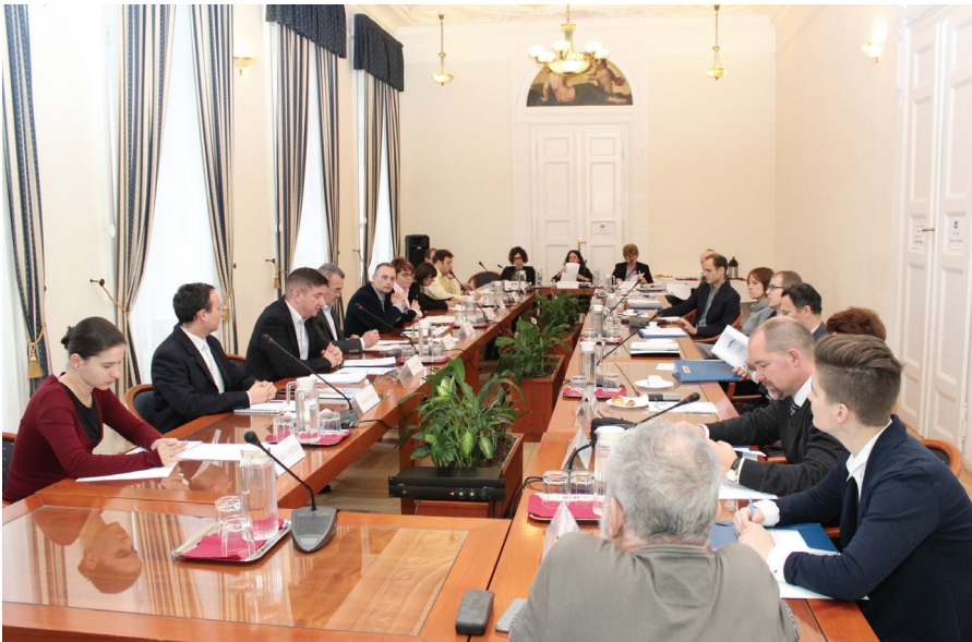
Meeting of the CCB, November 16, 2016

The representative of the Hungarian Psychiatric Association suggested that the NPM should inquire into the practices of the judicial review of emergency and mandatory treatment on the one hand, and the restrictive measures on the other hand. He pointed out: in the case of the former, the entire procedure is extremely formal (the expert makes only a written statement, is not present at the trial, may not be asked questions, the guardian ad litem is not present); examples could be found in the case of the Merényi Hospital. As far as the latter case is concerned, the proceeding judges notified neither the patients' rights representative nor the relatives, and there are several problems with the documentation. The patient does not have any opportunity to stand up for his/her interests, and the observation periods/mechanisms, making a more nuanced assessment of individual cases possible, are missing.