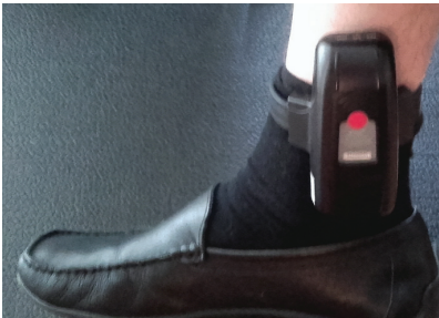
Tracking device on the body of the person under house arrest

could be conveniently done in the bedroom, even while sleeping. The waterproof device could resist the impacts of everyday life, it did not have to be taken off even while showering.