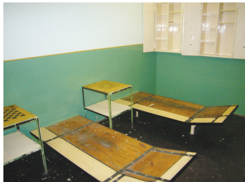
A cell in the Holding Facility of the NBI NPHQ

At the time of the visit, the 15 cells of the Holding Facility of the NBI NPHQ could accommodate 36 persons. There were nine male detainees, including three Syrian nationals, held there at the time of the visit. Among them, five were in criminal and four in pre-trial detention. There were no juveniles among the detainees. There were no new arrivals during the visit. Information material on the detainees' rights and obligations and the rules of their detention were available, in addition to Hungarian, in 17 languages. Every detainee gets a copy upon reception.