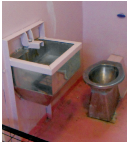
At the time of the 2016 visit